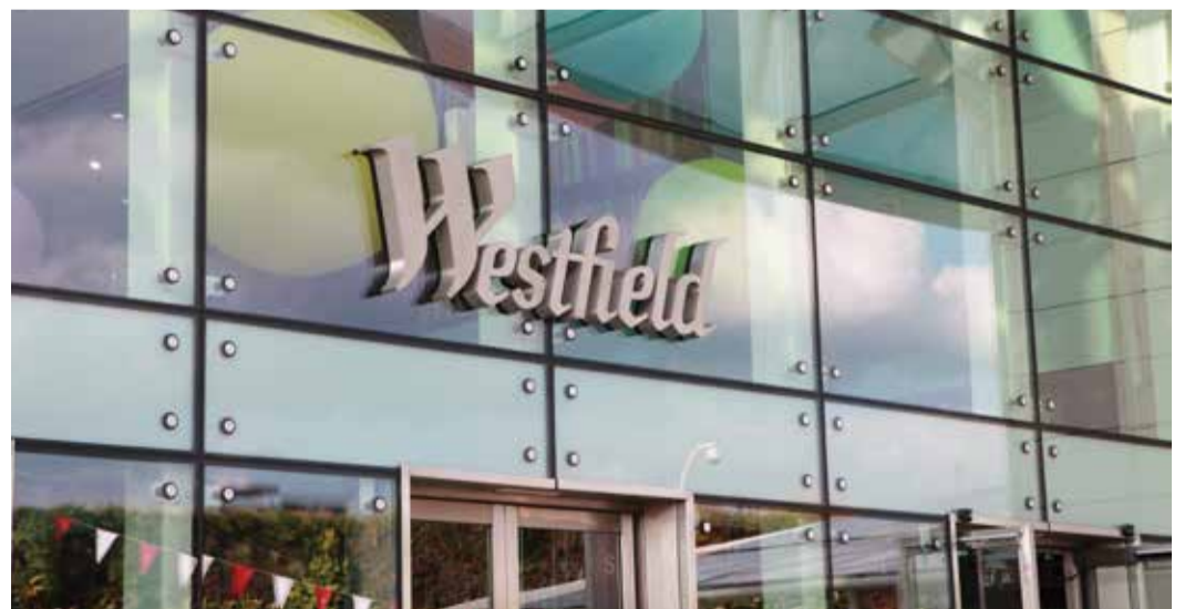
Westfield London Shopping Centre