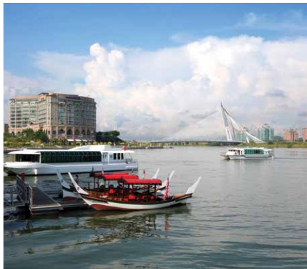
Cruise Tasik Putrajaya

A visually appealing cityscape, Putrajaya is also known for its numerous grand Government buildings, mosques, palaces and monuments.