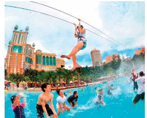
Sunway Lagoon Theme Park