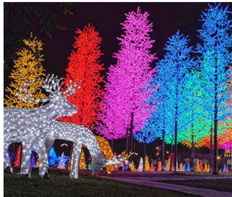
i-City, Shah Alam